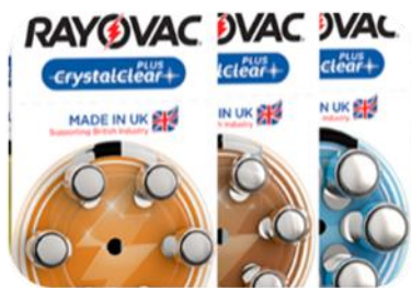
7. Batteries may be in an orange, brown or blue packet depending on type of hearing aid