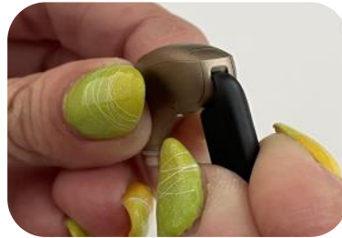
3. Open up the battery door. Using the opening tool as a lever.