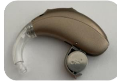
4. You will see the battery