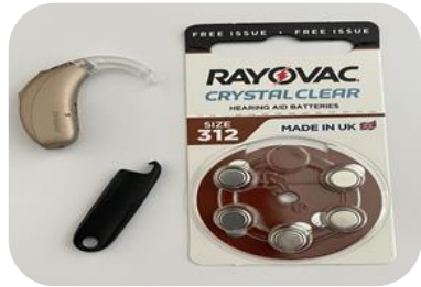
1. Equipment you will need