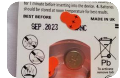
6. Put the dead battery back in pack and store out of reach of children. Do not put the sticker on it.

You may need to push it out with a pencil or pen.