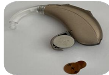
9. Insert battery with flat side up so you can see the cross. There is usually a picture in the battery compartment to help.