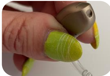
2. There is a tiny hole normally at the bottom of the hearing aid to put the unlocking tool into.