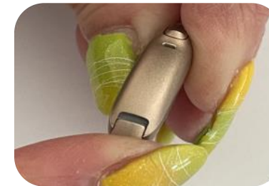
10. Close the battery door. If it is difficult to close the battery door the battery may be in the wrong way.

Do not force the door as this can damage the hearing aid.