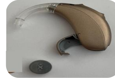
5. Take out the dead battery.

You may need to push it out with a pencil or pen.