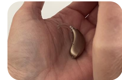
11. Check hearing aid is working in cupped hand. (you will hear a whistling noise)

Do not force the door as this can damage the hearing aid.